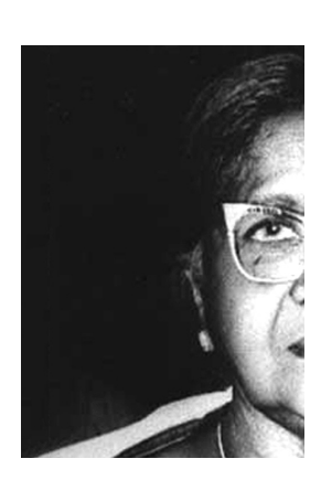
Sole Custodians (