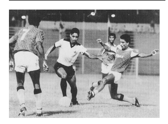
The Outsider's 90 Minutes