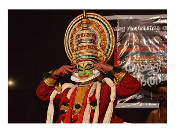
Why Does Doubt Grow On You, O Manasa?